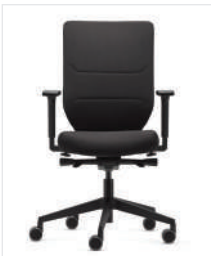
(FRONT) UPHOLSTERED WITH ARMRESTS 4-D GRAPHITE BLACK #K002056