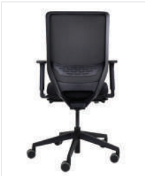
(REAR) MESH WITH ARMRESTS 4-D GRAPHITE BLACK #K002054