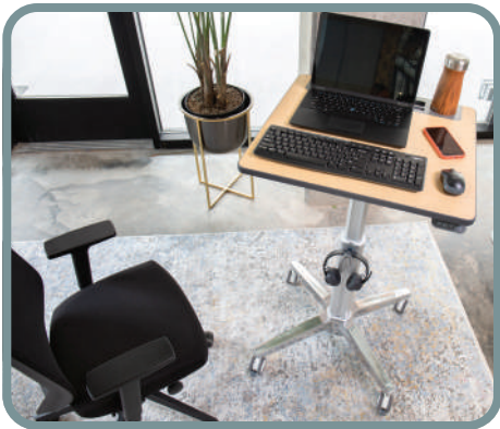
WF UPHOLSTERED CHAIR WITH ARMRESTS 4-D

Configuration locks in 3 positions 5 cm seat-depth adjustment with sliding seat