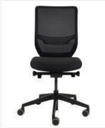
(FRONT) MESH GRAPHITE BLACK #K002053