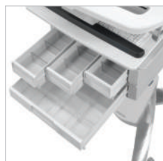
SEVERAL DRAWER CONFIGURATIONS