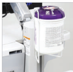
SV SANI-WIPES HOLDER