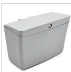
SV STORAGE BIN