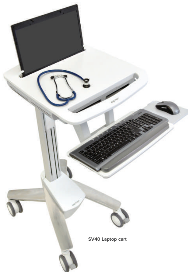
SV40 Laptop cart