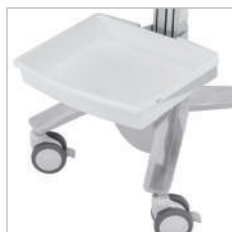
SV FRONT TRAY